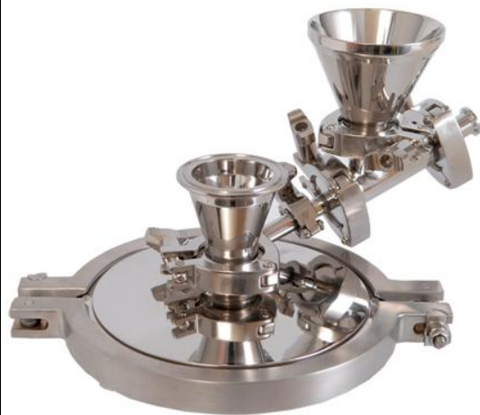
Fluid Jet mill J-200